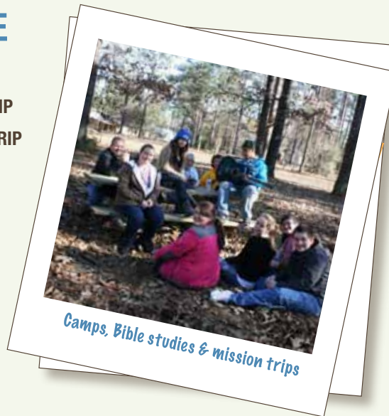
Camps, Bible studies & mission trips